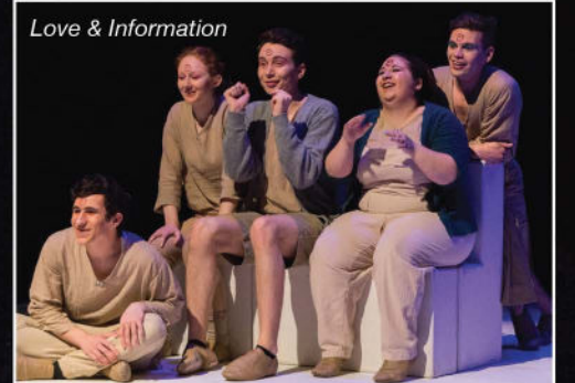
Love & Information