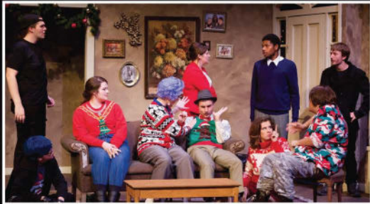
In-Laws, Outlaws, and Other People (That Should Be Shot)

Our program emphasizes practical experience at every level of production. We offer students transformative experiences; students perform, design, direct, choreograph, construct, circuit, paint, sew, write plays, research and teach.