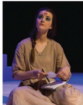
Love & Information