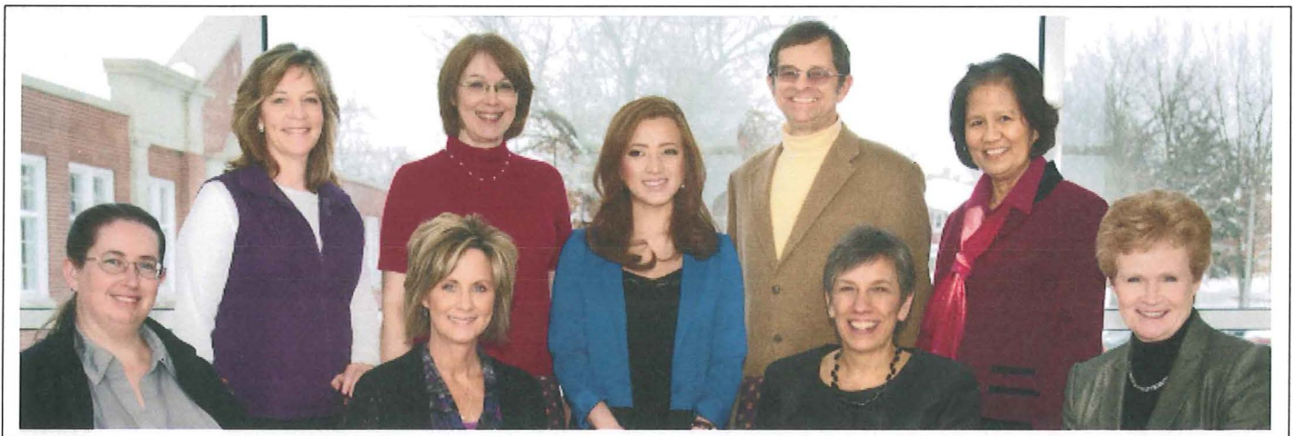
Nursing Faculty Members