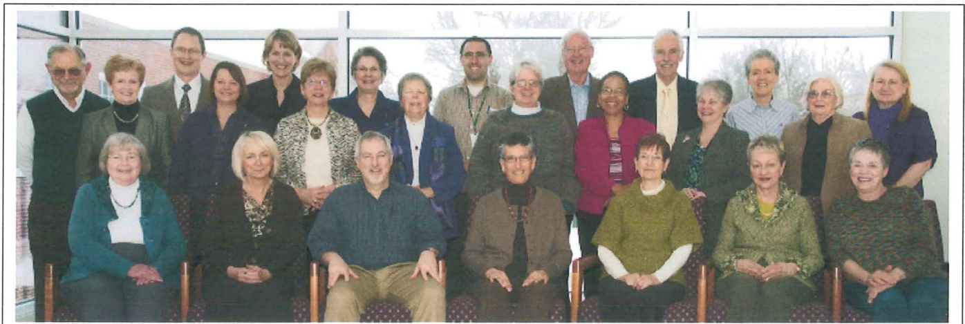
Nursing Advisory Council Members