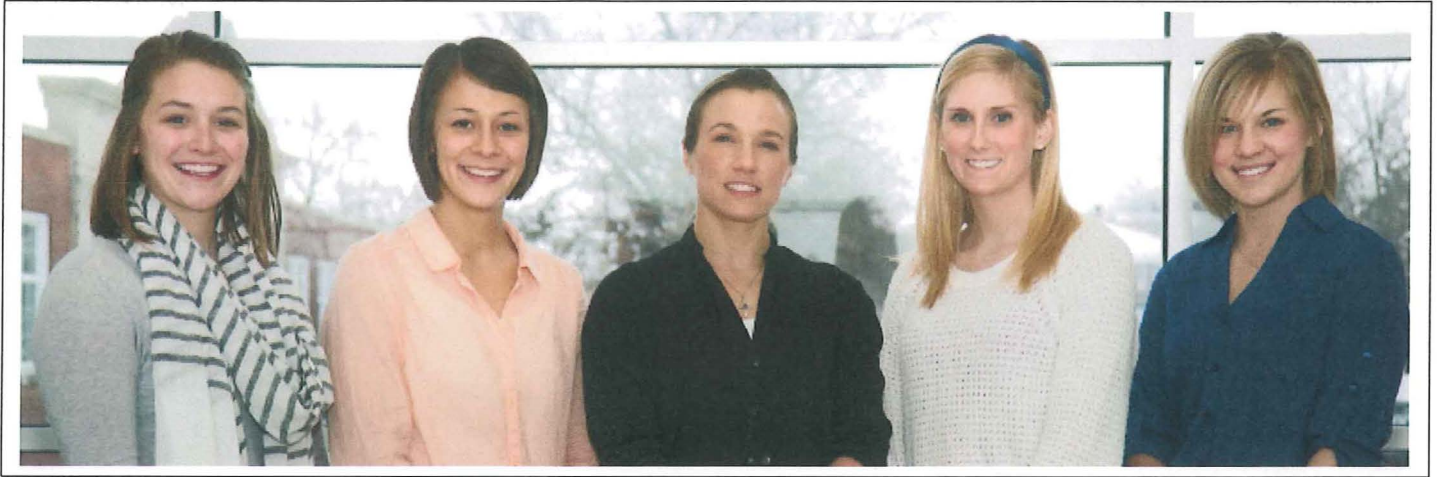
Nursing Student Panel Members

The Department of Nursing hosted a Nursing Advisory Council meeting on March 1. A panel of students shared their experiences in the interprofessional HouseCalls program. The Nursing Advisory Council discussed several strategies to support nursing education.