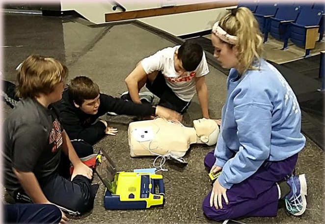
Seventh Grade Boys