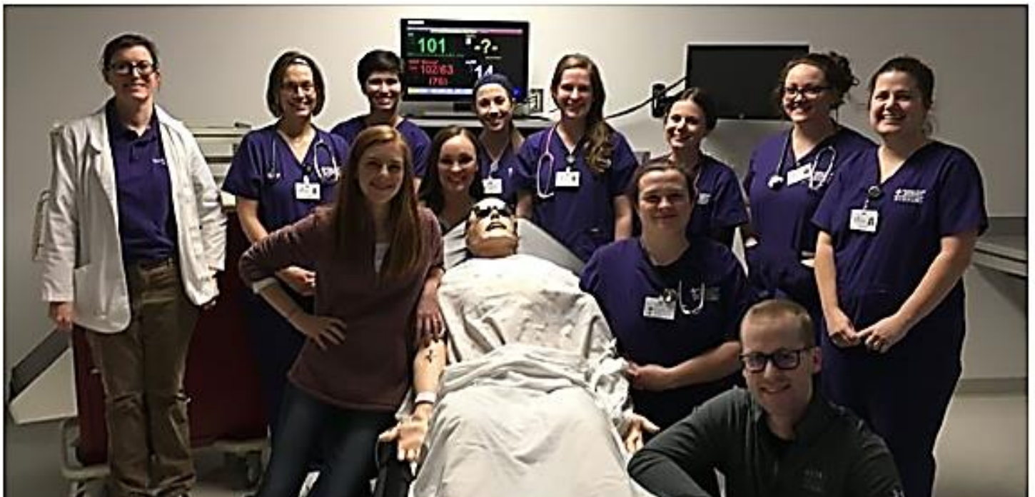
ATSU-KCOM students recently hosted and led a chest tube lab for Truman nursing students.